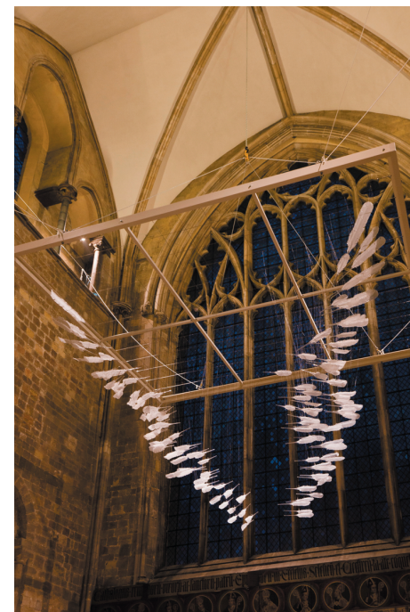
Glass feathers by Carrie Fertig, annealed in the GL-18AD at Chichester Cathedral in England.