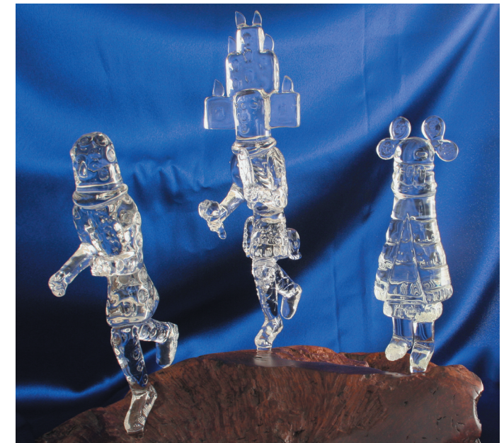
Glass borosilicate sculptures by Lewis Wilson of New Mexico.