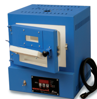
The 1" x 3" glass window and bead door