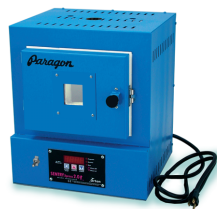
The 2" x 2" glass window