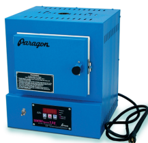
The standard door

nealing door and 2" x 2" without the bead door. (Note: always wear firing safety glasses when viewing the kiln interior.) The glass window is guaranteed up to 2350°F (1260°C). The SC-1 can be ordered with an optional 1" x 3" window. It is not available with bead door.