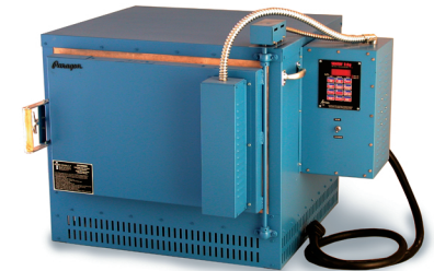
Janus-24 Digital Automatic Interior 22 1/2" deep, 24" wide x 15" high

The patented control box on the Janus-23 and Janus-27 opens forward for easy maintenance. A folding support arm holds the box in the open position.