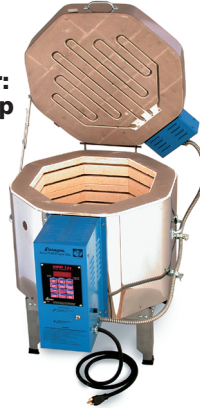
Janus-1613 Digital Automatic 8-sided Firing Chamber: 16 1/2" wide x 13 1/4" deep

© 2004, by Paragon Industries, LP / PA-125/2-06 Specifications subject to change without notice.