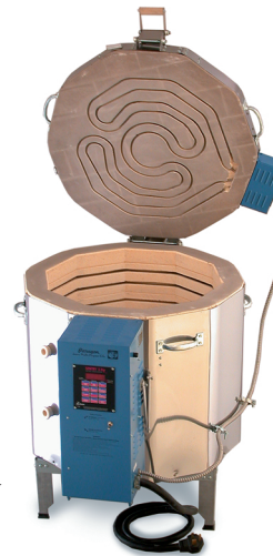
Janus-23 Digital Automatic 10-sided Firing Chamber: 22 1/2" wide x 20 1/4" deep