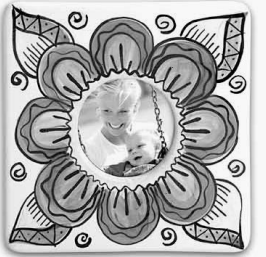
A perfect gift for grandparents: a ceramic picture frame.

© 2002, by Paragon Industries, Inc. / PA-111/5-03 Specifications and prices subject to change without