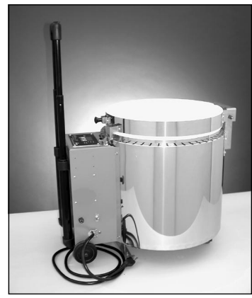
The carrier handle locks upright with fingertip pressure.